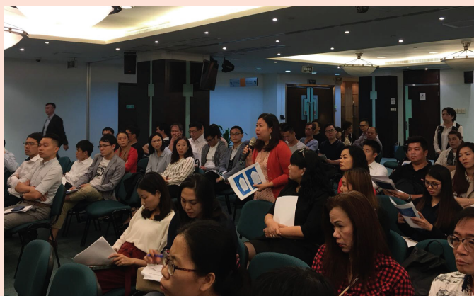
Attendees and guests conducting in-depth discussion on the actual operation of the pre-loaded inspection system

CEPA, but also those imported into the Mainland through Macao, helping to attract enterprises from Portuguese-speaking countries to explore the Mainland market by making use of Macao's role as a platform, providing positive effects for Macao's development as a food product distribution centre for Portuguese-speaking countries.