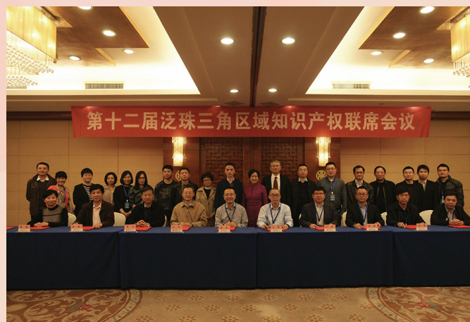
Group photo of attending guests