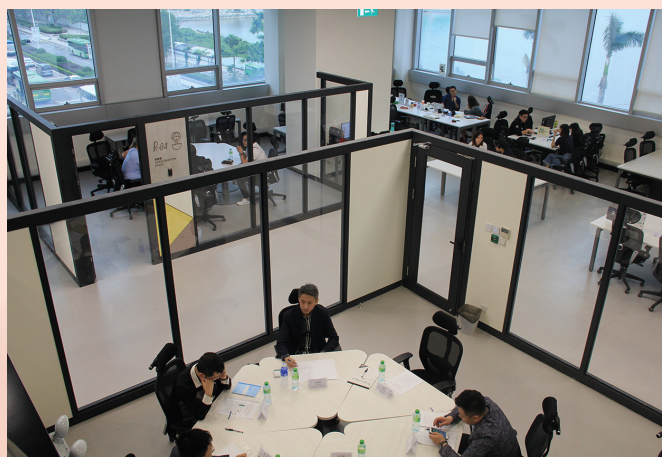
The new Incubation Centre will focus on providing systematic support services to youth startups

The new Incubation Centre will also collaborate with venture capital funds and accelerators to organise roadshows of