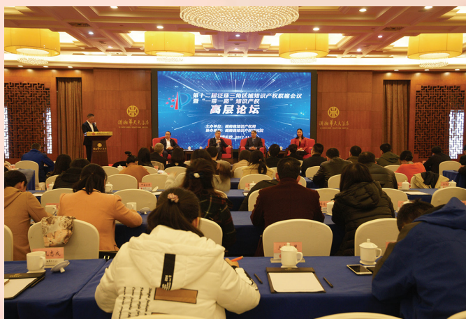
Venue of the Intellectual Property Rights High-level Forum

property rights experts, scholars and delegates of intellectual property offices, enterprises, high schools and trademark/patent agencies from the Pan-Pearl River Delta Region attended the Forum.