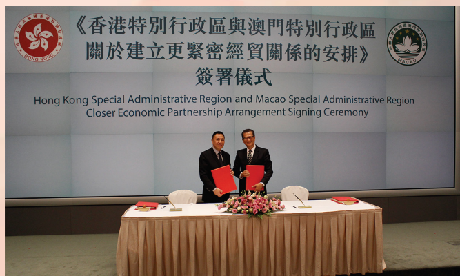
HK-Macao CEPA signing ceremony

To promote economic and trade cooperation and exchange between Hong Kong and Macao, and create a more favourable environment for future economic integration among regions, especially in respect of the integration among cities in the Guangdong-Hong Kong-Macao Bay Area, the 10th Hong Kong Macao Cooperation High Level Meeting was held between Hong