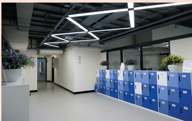
Macao Young Entrepreneur Incubation Centre

The SAR Government highly values nurturing Macao youth's innovation and entrepreneurship capabilities. To promote the development of youth innovation and entrepreneurship, the Macao Economic Bureau (DSE) set up the Macao Young Entrepreneur Incubation Centre (MYEIC) in June 2015 in order to provide free-of-charge temporary office space and one-stop services for youth startups, so as to encourage youth to innovate and start up new businesses. From 2015 to October 2017, MYEIC received a total of 112 new applications and 27 renewal applications