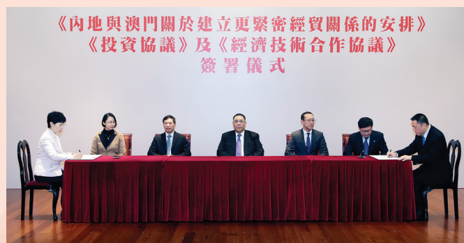
Enhancement of CEPA signing ceremony