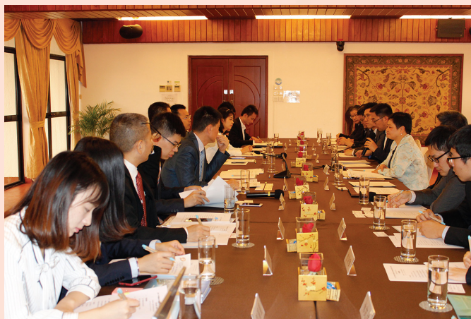
Guangdong-Macao Task Force on the Development of China (Guangdong) Pilot Free Trade Zone Meeting 2017

The “Guangdong-Macao Task Force on the Development of China (Guangdong) Pilot Free Trade Zone Meeting 2017” was held in Macao on 31 October 2017, at which both sides exchanged views on the development of Hengqin Area, Nansha Area and Qianhai Area. The Guangdong side hoped to develop an integrated platform for displaying and selling products from