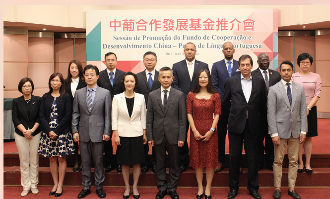
Group photo of attending guests

series of measures of the Central Government for supporting Macao's development. During the Session, representatives from the Macao headquarter of the CPDFund gave a detailed presentation on the targets of services, investment criteria, forms of investment, application procedures of, and information and documents required for application for the Fund to provide attendees a more