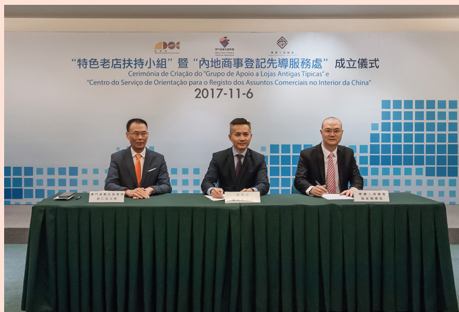
Inauguration ceremony of the “foster group for featured time-honoured brands”

supports the Guangdong and Macao Federation of Industry and Commerce in setting up a pilot service centre for Mainland business registration in Macao. During the first phase, the service centre will provide free-of-charge incorporation and individually-owned store registration services to Macao enterprises and residents, service items include: (1) Mainland company name search; (2) set up databases to review relevant registration details; (3) provide guidance to filling in registration documents; (4) set up a “green lane” to