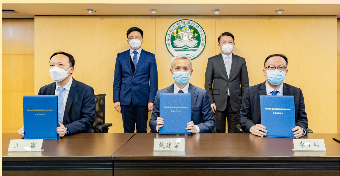
Representatives of Macao, Zhuhai and Hengqin sign together the Strategic Cooperation Agreement on Jointly Building the China-PSCs Technology Exchange and Cooperation Centre under the witnessing of leaders of Macao and Zhuhai

According to the agreement, the China-Portuguese-Speaking Countries Technology Exchange and Cooperation Centre will be developed together by the governments of Macao, Zhuhai and