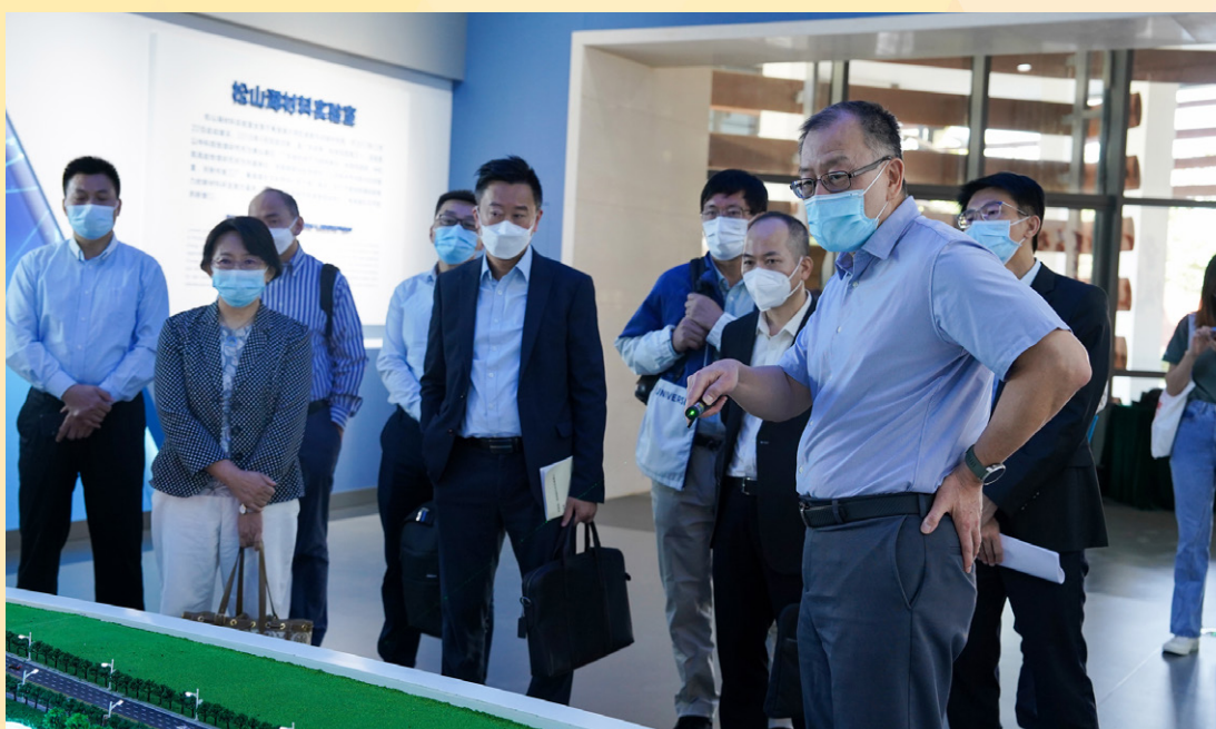
The group of representatives visits Dongguan’s Songshan Lake Material Laboratory

During the working meetings, both sides expressed intention to strengthen cooperation and explore some possible direction of work. Addition of collaboration projects between institutions of Macao and Dongguan will be explored on the existing basis. Also, Macao will be further utilized as a window of international exchange for exploring new modes of international scientific research and industrial exchange with a view to promoting the development of technology industry in the GBA.