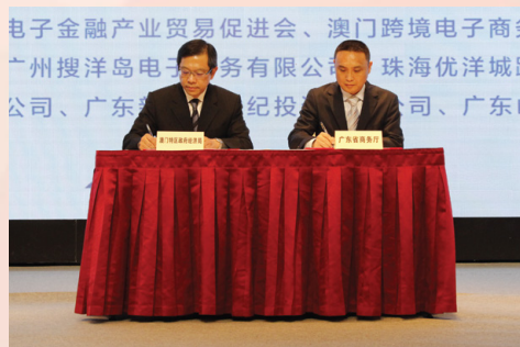
Macao Economic Services and Department of Commerce of Guangdong Province signed “Memorandum on Strengthening Cooperation of Cross-border E-Commerce Trade”

Macao Economic Services organized a delegation of 60 representatives from local e-commerce and related sectors to Guangzhou on 10 December, so as to promote the development of e-commerce in Macao, to expedite cross-border e-commerce, on-line and off-line marketing and the integration of traditional industries and e-commerce, to enhance the capability of internet sales for the local enterprises, in particular the SMEs, as well as, to embrace the development opportunities and change of consumption behaviour arose from “Internet +” era in the Mainland. The delegation participated in “Cross-border E-commerce: Building an Unlimited Innovative New