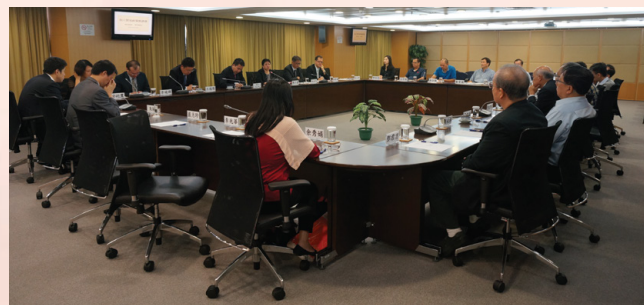
Processed Products Trade Policies Forum was held at Macao Economic Services

To strengthen the promotion of processed product trade policies and measures in the Mainland, Macao Economics Services and Ministry of Commerce of the PRC Department of Foreign Trade co-organized the “Processed Products Trade Policies Forum” on 15 October 2015. Mr. Zhou Hui, Commercial Counselor of Department of Foreign Trade, Ministry of Commerce, led the Mainland delegation to Macao, to introduce the latest processed products trade policies in the Mainland, and exchanged views with participants.