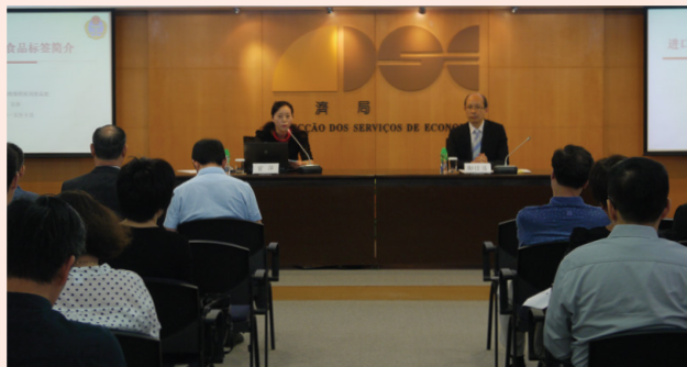
Macao Economic Services held a seminar on “Mainland rules and regulations on imported food labels”