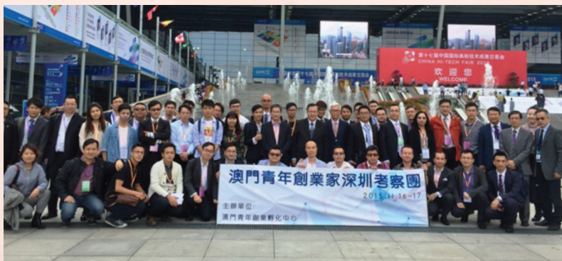
The “Business Incubation Centre for Youth” organized Macao young entrepreneurs to participate in the China Hi-Tech Fair held in Shenzhen

The Macao “Business Incubation Centre for Youth” organized a delegation of more than 30 Macao young entrepreneurs to participate the “Visit of Macao Young Entrepreneurs to Shenzhen”. On 16-17 November, the delegation participated in the China Hi-Tech Fair held in Shenzhen, with an aim of allowing Macao young entrepreneurs to understand the latest trend and development in hi-technology of various fields, and to come into close contact with hi-tech products and research results. In addition, through visiting the Shenzhen Software Industrial Park, Shenzhen Startup Center, and Shenzhen WeYoung International Start-up Center (WeYoung), Macao entrepreneurs had a deeper understanding of the local start-up business environment and relevant facilities, and exchanged with local start-up businesses.