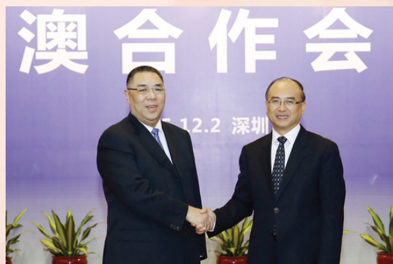
Shenzhen-Macao Cooperation Conference 2015 was held in Shenzhen