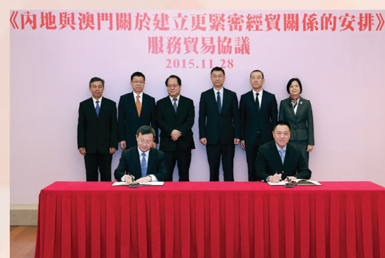
The signing ceremony of the Agreement on Trade in Services under the framework of the Mainland and Macao Closer Economic Partnership Arrangement

The Agreement on Trade in Services under the framework of the Mainland and Macao Closer Economic Partnership Arrangement (CEPA) (hereinafter referred to as the “Agreement”) was signed in Macao on 28 November 2015. In accordance with the Agreement, the Mainland will open up 153 services trade sub-sectors to the Macao services industry starting from 1 June 2016. Among all, the positive lists have newly added 20 liberalization measures, including 5 newly added liberalized sectors for individually owned stores, making the total number of liberalized sectors for individually owned stores to reach 135. The Agreement is the first free trade agreement which liberalizes trade in services to the whole Mainland with market access provisions for national treatment and the management approach of negative listings. It also re-states the existing liberalization content under CEPA and its Supplements, signifying the basic liberalization of trade in services between the whole Mainland and Macao.