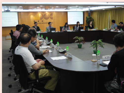
Representatives visited Macao Economic Services and participated in the exchange

On 28-30 October 2015, Macao Economics Services and Intellectual Property Department of Hong Kong SAR Government jointly organized the “Pan-Pearl River Delta Public Staff Exchange Program on Intellectual Property Protection”, with an aim to enhance the mutual understanding of the work on intellectual property, thereby promoting the exchanges and cooperation of intellectual property protection in the region.