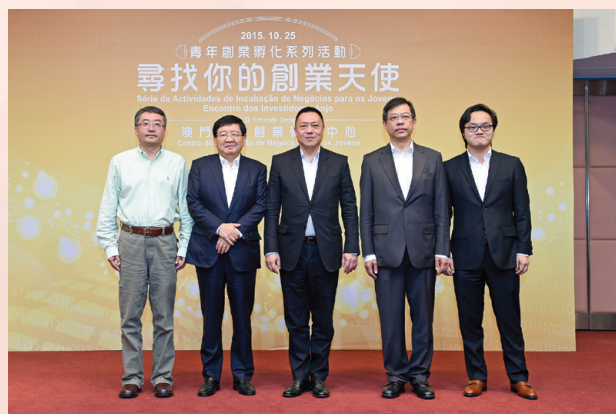
Group photo of the keynote speakers and leaders of the organizer