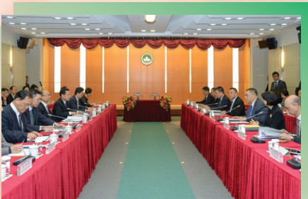
2016 Guangzhou-Macao Cooperation Task Force meeting