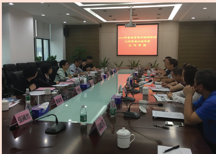
Guangdong - Macao Task Force Meeting on the Work of Quality Testing and Certification