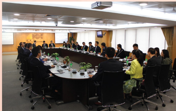
Guangdong - Macao Task Force Meeting on Promoting Guangdong Pilot Free Trade Zone

In respect of the signing of the “Cooperation Agreement on the Joint Promotion of the Guangdong Pilot Free Trade Zone” between Guangdong and Macao and under the umbrella of the Guangdong - Macao Task Force, the two sides have established a cooperation mechanism to jointly promote the construction of the Guangdong Pilot Free Trade Zone (PFTZ). The mechanism sets to step up and deepen the trade, investment and financial cooperation and exchanges within the Guangdong PFTZ. The Task Force also attempts to turn the Guangdong PFTZ to be a demonstration zone to disseminate their effect onto the Pan-Pearl River Delta Region. The contents of the Cooperation Agreement include: deepening the promotion of the innovation in the PFTZ system; encouraging Macao enterprises to participate in the construction of the Guangdong PFTZ; elevating the trade cooperation level between Guangdong PFTZ and the Portuguese-speaking countries by capitalizing the unique privileges of Macao; and boosting the connectivity between the youth of Guangdong and Macao.