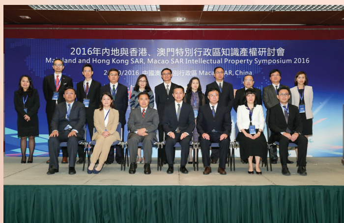
The Mainland, Hong Kong SAR and Macao SAR Intellectual Property Symposium 2016

This has been the 17th session of the IP symposium, of which the first session was dated back to 2000 and since then, the three places take turn to host this annual event. The symposium has, by all means, constructed a platform to strengthen exchange, communication and promote cooperation for the IP professionals and agents among the three places.