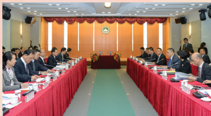
The Shenzhen-Macao Cooperation Conference 2016

The Conference put forward new cooperation priorities, including: seizing the period of strategic opportunities to