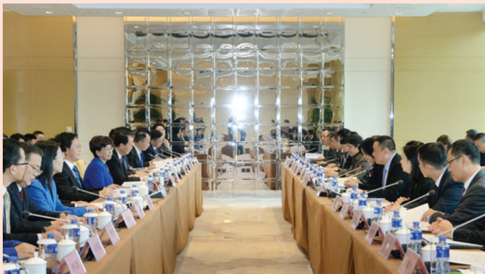
The Zhuhai-Macao Cooperation Conference 2016