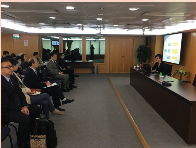
Macao Economic Services held a Special Session on Regulating Cosmetics

concern of product safety. The Macao Economic Services shall keep track of the market situation to organize special session on product safety from time to time, in order to educate the general public with knowledge in due respect, and will, as usual, do the best on the related work in regulating the market.