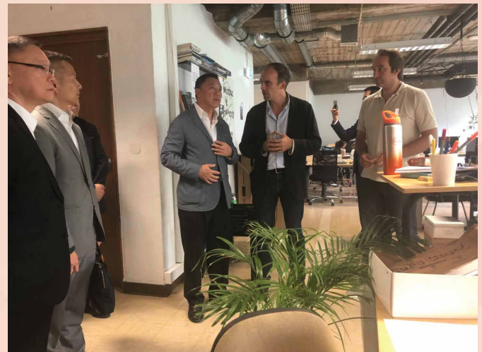
The Macao entrepreneur delegation visits Beta-i and exchanges with local young business starters

Cooperation Business Meeting held in Lisbon, Portugal. Parafuturo will set up a "Macao Interaction Zone" in Lisbon, while both sides can make recommendations to each other on youth startup enterprises moving in to each other's incubation centre. This, accompanied with the launch of the China-PSCs Youth Innovation and Entrepreneurship Exchange Programme, can provide a more precise support to Macao's young business starters for innovating and starting up new businesses in Portugal. During the Business Meeting, the delegation, led by the Secretary for Economy and Finance, visited Beta-i, and participated in the closing ceremony of the challenge camp of the Fosun Protechting Global Youth Entrepreneurship and