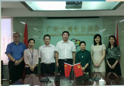
Visit to the Guangzhou Municipal Commission of Commerce

To implement and actively participate in the work on promoting the development of the Guangdong-Hong Kong-Macao Bay Area, as well as to strengthen the exchange and cooperation between the Macao Economic Bureau (DSE) and local commercial authorities in the Bay Area, a delegation of the DSE recently visited the nine Mainland cities of the Guangdong-Hong Kong-Macao Bay Area to meet with the leaders of the local commercial authorities, and visit the Macao-owned enterprises, as well as high and new technology parks in those places. By visiting the commercial authorities of the nine cities of the Bay Area, the DSE hopes to establish close partnerships and