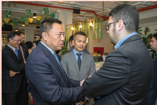
The Secretary for Economy and Finance visits Fábrica de Startups, a youth startup enterprise centre in Rio de Janeiro, and exchanges with the persons-in-charge of four youth entrepreneurship projects

Portugal and Brazil and headed back to Macao on 28 June. (Source: Secretariat for Economy and Finance of Macao, Macao Young Entrepreneur Incubation Centre)