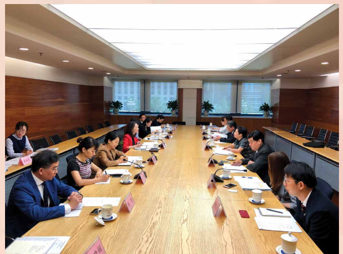
The Meeting of Task Group on Trade in Goods Facilitation under CEPA is held in Beijing

In respect of consultation on customs clearance facilitation, the Meeting of Task Group on Trade in Goods Facilitation under CEPA was held on 14 June in Beijing between a Macao delegation, comprised of representatives of the DSE, Macao Customs, Civil and Municipal Affairs Bureau (IACM) of Macao and Macao Trade and Investment Promotion Institute (IPIM), and representatives of China's Ministry of Commerce, Hong Kong and Macao Affairs Office, GACC, Certification and Accreditation Administration and other authorities. At the meeting, both sides reviewed the achievements in the trade