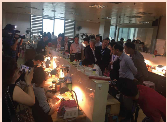
Presented with exhibition of processes of high-end jade polishing and carving