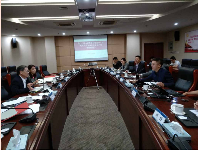
The Consultation Meeting on Specific Issues Related to ROOs for the Agreement on Trade in Goods under the China-Macao CEPA is held in Chongqing

The consultation on the Agreement on Trade in Goods under CEPA officially kicked off with the first Senior Officials' Meeting for enhancement of trade in goods under CEPA convened in Macao on 20 March. In respect of rules of origin (ROOs) consultation, the Consultation Meeting on Specific Issues Related to ROOs for the Agreement on Trade in Goods under the China-Macao CEPA was held between the Mainland's General Administration of Customs (GACC) and the Macao Economic Bureau (DSE) on 25 May in Chongqing to consult on the details of the ROOs-related articles and chapters of the Agreement on Trade in Goods under CEPA. In-depth communication and discussion were made over technical issues such as wholly