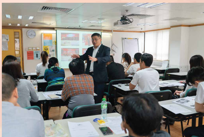
Guest speaker gives a presentation on the latest trend of cross-border e-commerce

To enable small and medium enterprises (SMEs) to get a better grasp of cross-border e-commerce skills, the DSE organised the Cross-border E-commerce Marketing Strategy Workshop from 9 June to 10 June by