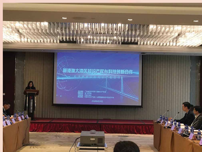
Guangdong-Hong Kong-Macao Bay Area IP and technology innovation cooperation exchange activity

technology exchanges and cooperation between Guangdong, Hong Kong and Macao. After the activity, the representatives visited HIPEX, a national IP operation platform, to discover on-site the platform’s operating conditions, business pattern and future trend of development.