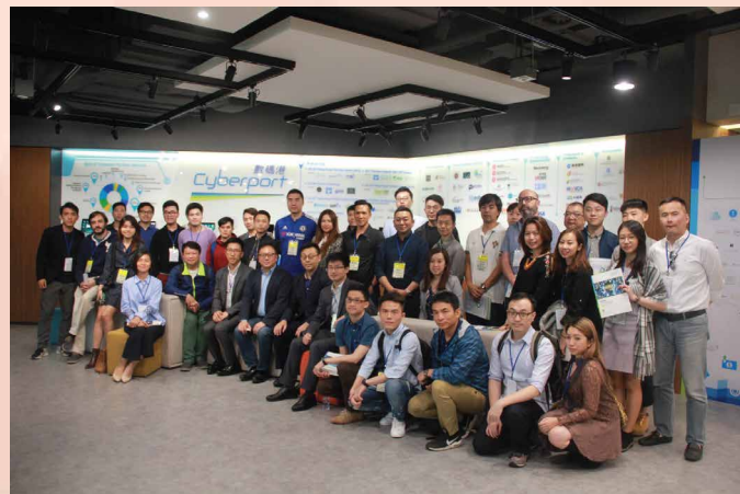
The Exchange Tour concludes with an exchange visit to Hong Kong's Cyberport

entrepreneurship and creating better conditions for Macao's innovation and entrepreneurship environment.