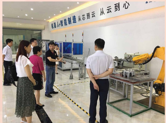
Site visit to a Bay Area city technology company

During the trip, the delegation visited the Guangdong-Macao (Jiangmen) Industrial