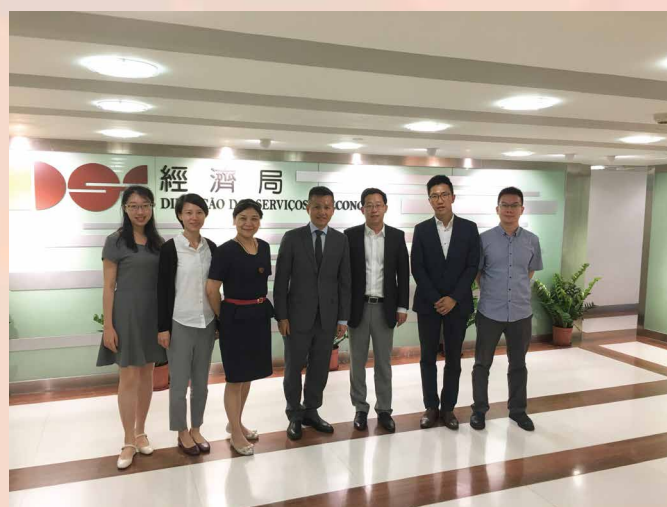
Representatives of the Qianhai authority and the CMCF visit the DSE

Competition 2018 to provide an ideal exchange platform to youth entrepreneurs in the three places with a view to jointly promoting the collaborative development of youth innovation and entrepreneurship among the Guangdong-Hong Kong-Macao Bay Area. After the meeting, representatives of the Shenzhen side visited the Macao Young Entrepreneur Incubation Centre located at The Carat.