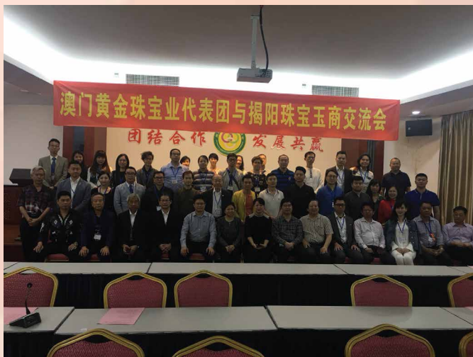
Exchange and discussion between the sectors of the two places

To fulfil the role of the task force on services sector cooperation between Guangdong and Macao under CEPA on the basis of the Framework Agreement on