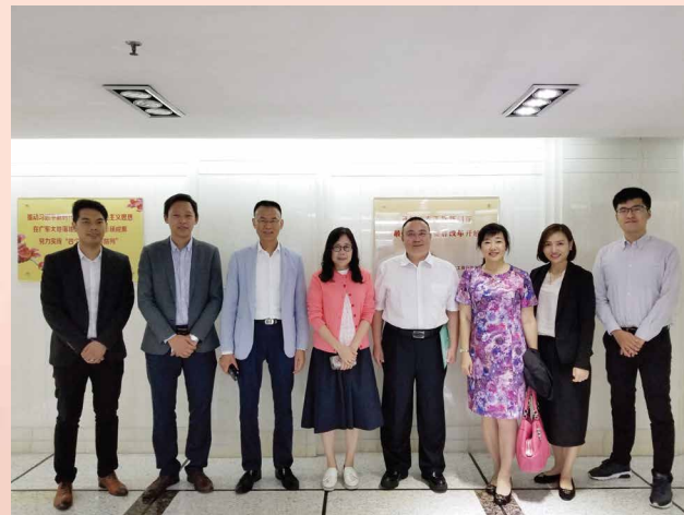
Group photo of the attending representatives

representatives of trade associations and enterprises in Guangdong, Hong Kong and Macao attended the activity, during which discussions revolving around topics such as the branding development of classic stores/brands and trademark registration examination standard were made. After the session, representatives from Hong Kong and Macao visited the Guangzhou Trademark Examination Center of the State Intellectual Property Office.