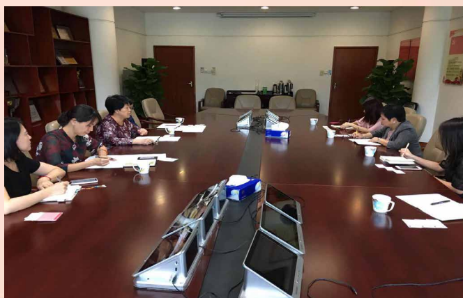
Meeting with the Economic, Trade and Information Commission of Shenzhen Municipality

To implement and actively participate in the work on promoting the development of the Guangdong-Hong Kong-Macao Bay Area, as well as to strengthen the exchange and cooperation between the Macao Economic Bureau (DSE) and local commercial authorities in the Bay Area, a delegation of the DSE recently visited the nine Mainland cities of the Guangdong-Hong Kong-Macao Bay Area to meet with the leaders of the local