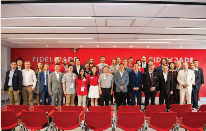
The Secretary for Economy and Finance participated in the Fosun Protechting Global Youth Entrepreneurship and Innovation Competition's challenge camp closing ceremony

To materialise Macao's development as a commercial and trade cooperation service platform between China and Portuguese-speaking countries (PSCs), and keep promoting the development of the China-PSCs Youth Innovation and Entrepreneurship Exchange Centre, the Macao SAR Government organised a delegation of Macao entrepreneurs to travel to Portugal and Brazil between 19 June and 29 June for exchange and visit. During the period, Parafuturo de Macau Investment and Development Limited signed a cooperation agreement with Beta-i, a renowned Portuguese incubator, on 21 June at the China and PSCs Economic and Trade