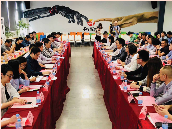
Exchange and discussion with youth entrepreneurship authorities and local startup enterprises in Zhongshan

To encourage the youth of Macao in integrating themselves into the development and progress of the Guangdong-Hong Kong-Macao Bay Area, the Guangdong-Hong Kong-Macao Bay Area Macao Youth Entrepreneurship Exchange Tour, hosted by the Macao Economic Bureau (DSE) and co-hosted by Parafuturo de Macau Investment and Development Limited, was successfully held between 12 April and 14 April of 2018 with the participation of 42 representatives of Macao's youth associations and youth startup enterprises. During the 3-day study visit, the Tour visited the youth entrepreneurship incubation bases in 5 cities