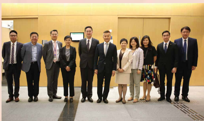
Group photo of the attending representatives of the Working Group on Enhancing Hong Kong/Macao Economic Cooperation meeting

To promote the economic development of Hong Kong and Macao, the Working Group on Enhancing Hong Kong/Macao Economic Cooperation held this year's meeting in Hong Kong in the afternoon of 5 June. Both sides agree that both Hong Kong and Macao have their own unique advantages to play indispensable roles in the national development and to complement each other. The development of the Guangdong-Hong Kong-Macao Bay Area, in coordination with the development strategies of the "Belt and Road" Initiative, will provide historic opportunities for the economic development of the two places. Hong Kong and Macao will strengthen the cooperation in areas such as economic activities, tourism and investment promotion, and explore new room for development.