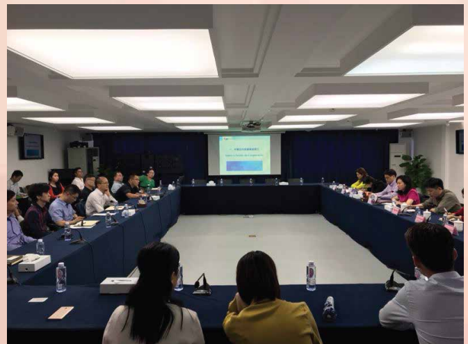
CPDFund Promotion Seminar

processes, strengths of the fund and specialities of the management team; during the exchange session, the attending representatives stated that the CPDFund could provide enterprises in Qianhai, Shenzhen with new development opportunities, as the management team of the CPDFund could provide assistance in terms of business experience and information network, which would favour the search for suitable investment projects.