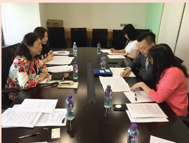
Guangdong-Hong Kong-Macao Bay Area IP promotion meeting

To further promote collaboration among the Guangdong-Hong Kong-Macao Bay Area in the development in the area of intellectual property (IP), and to strengthen