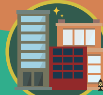
Construction and engineering