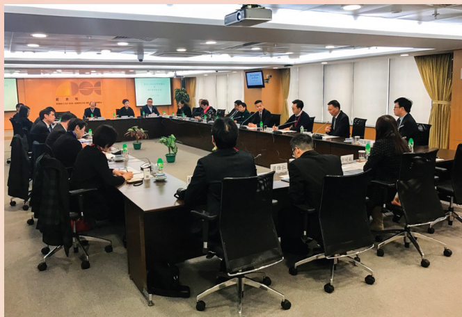
The delegation of the State Administration for Industry and Commerce of the Mainland held exchange session with representatives from Macao

grasp hold of the mega trend of international e-commerce. Both sides agreed to maintain communication and exchange of information in order to boost up economic development.