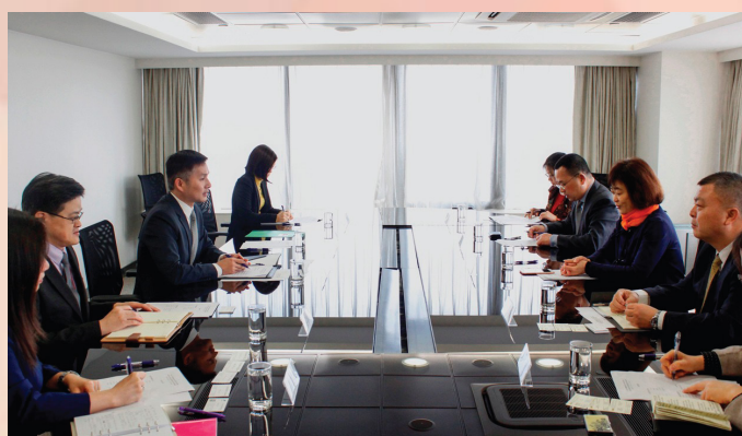
The representatives from Guangdong and Macao in meeting.

discussed the direction and contents of services cooperation, which include cross-border e-commerce cooperation; services outsourcing cooperation; F&B cooperation; organising inspection tour to the east, west and north of Guangdong; as well as drafting the work plan for this year.