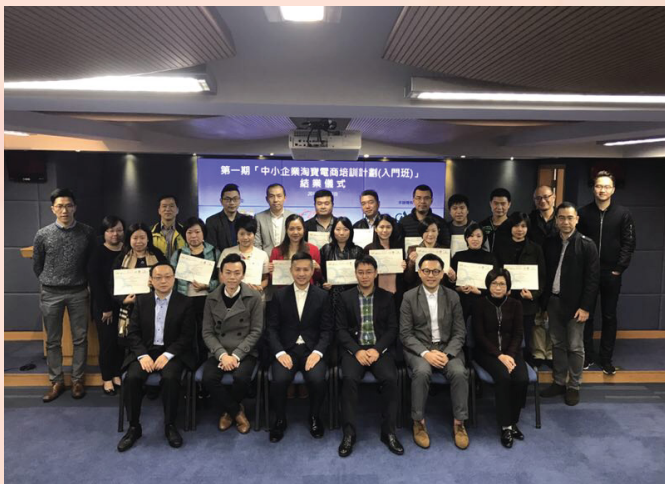
Photo of participating guests, lecturers and students

Co-organised by Macao Economic Services and Alibaba Entrepreneurs Fund, the first “Taobao E-Commerce Training Program for SMEs (Foundation Course)” was successfully held on two consecutive weekends in mid-February. During the closing ceremony on 12 March, qualification certificates were awarded to 25 trainees who had passed the examination. This course received full support and assistance from Association of Zhejiang Entrepreneurs of Macao, Taobao University