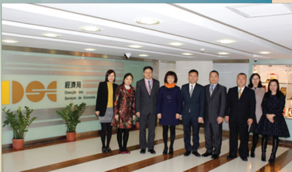
“2017 Guangdong-Macao Services Cooperation Task Force Meeting” was held in Macao