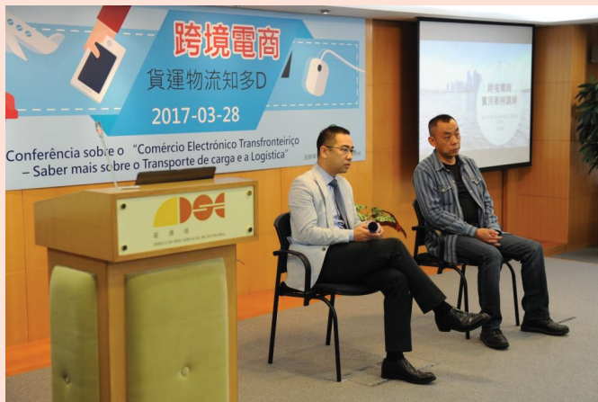
Interactive exchange between guest speakers and audience

e-commerce provided new impetus to economic development, and hence, the MSAR Government supports the SMEs to seize the mega trend of e-commerce development, the opportunities brought forth from the development of “Internet +” in the Mainland and combine them with the e-commerce innovation development to contribute to the appropriate economic diversification of Macao. The main objective of this Session is to help enterprises to learn more about the actual operation in freight and logistics of cross-border e-commerce in order to facilitate enterprises to start-up their e-commerce business. Meanwhile, the MSAR Government shall continue to organise events and activities to provide information from all perspectives on cross-border e-commerce to the public.