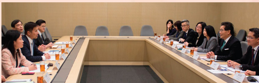
The Meeting of “Working Group on Enhancing Hong Kong/Macao Economic Cooperation” was held in Hong Kong