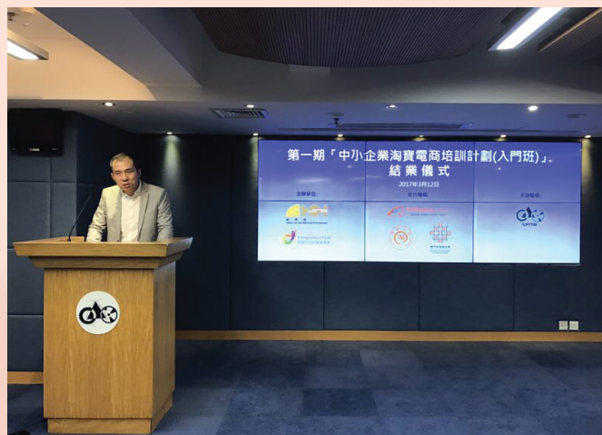
Student representative shared his learning experience and future plan of e-commerce

promoting the development of e-commerce in Macao, encouraging the MSMEs and young entrepreneurs to make innovative development through the e-commerce platform, expanding business network, in order to grasp the vast opportunity brought by the “Internet+”. It was hoped that the trainees could apply the knowledge and techniques in e-commerce acquired in their own career development, so as to promote business upgrading and transformation. A trainee representative, who was invited to the stage to share his learning experiences, mentioned that the content of this e-commerce program was enriching. He learnt a lot under the guidance of the mentor, had a more in-depth understanding in e-commerce. Meanwhile, it inspired his personal development plan and the change of mindset on business operating model, established an information exchange platform among the participants, so as to