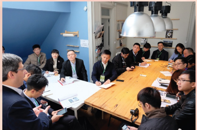
Interaction between the Macao delegation and the responsible persons of the incubation centre.

the Chinese ambassador to Portugal, Mr. Cai Run, after arriving Portugal. Cai Run briefed the delegation about the political and economic development in Portugal, as well as the updates of the Sino-Portuguese relation, and hoped that China, Portugal and Macao could strengthen cooperation in the area of business startup. During their stay in Portugal, the delegation visited three start-up centres, namely, Startup Lisboa, Second Home and Fabrica de Startups, which were of different operating modes, so as to learn and understand the operation of the incubation system for new businesses in Portugal.