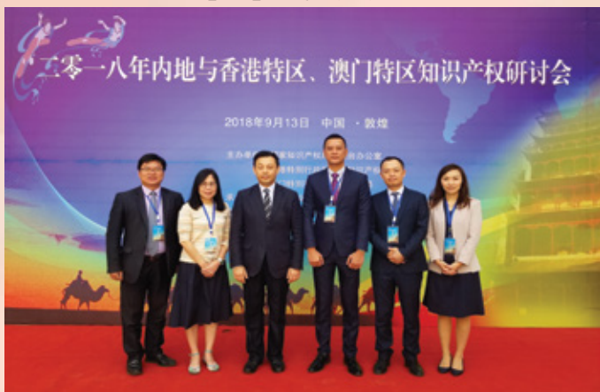
Representatives of the DSE attend the Mainland and Hong Kong SAR, Macao SAR Intellectual Property Symposium 2018

The Symposium invited experts, scholars and entrepreneurs of the IP industry from the three places as guest speakers. Revolving around the theme “IP: propelling innovation, growth and prosperity”, they conducted in-depth discussions and exchanges on three topics, namely “IP protection supporting innovative development”, “strengthening IP utilisation for materialising the value of IP” and “strengthening IP service for supporting enterprises to ‘go abroad’”, demonstrating the new areas and new features of modern IP development from multiple perspectives and advancing many valuable views and opinions that inspired direction and thinking in the development of IP business. Through this exchange platform, IP practitioners of the three places drew on and learn from each other’s experience in order make up for their own shortcomings. This facilitated the dissemination and exchange of experience and achievement between the three places, and also deepened and promoted the mutual