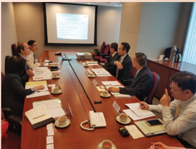
The two sides conduct exchanges on the flow of information on product safety under the HK-Macao CEPA

To enhance exchanges in multiple areas of cooperation in the Economic and Technical Cooperation Work Programme under the HK-Macao CEPA, especially the cooperation and exchanges related to technical barriers to trade concerning product safety, a quartet including our Head of Licensing and