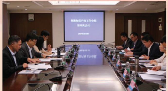
The Guangdong-Macao Intellectual Property Working Group holds its fourth meeting in Guangzhou

With the aim of strengthening the exchange and cooperation between Guangdong and Macao in the different aspects of intellectual property protection, the Guangdong-Macao Intellectual Property Working Group was established on 10 May 2012 following its first meeting convened in Guangzhou. The Group comprises of intellectual property administration and protection authorities of Guangdong and Macao. Members of the Guangdong side include the Guangdong Intellectual Property Office, the Guangdong Press, Publication, Radio, Film & Television Bureau, the Department of Public Security of Guangdong Province, and the Guangdong Sub-Administration of China Customs; members of the Macao side include the Macao Economic Bureau and the Macao Customs Service.