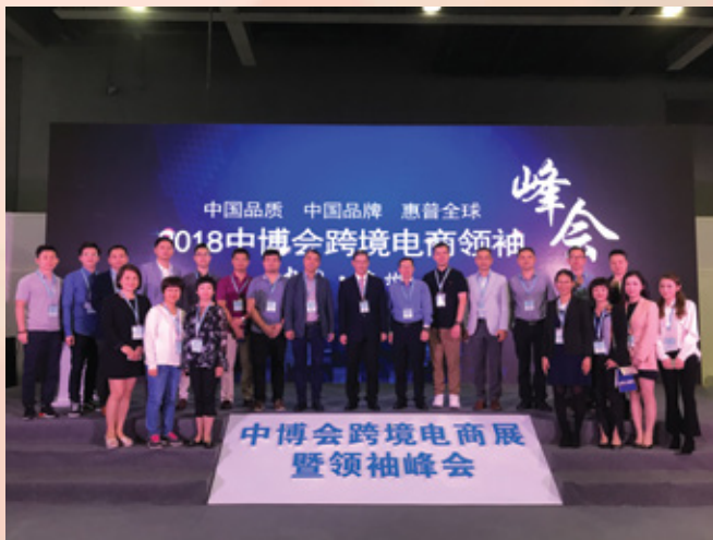
Macao's e-commerce sector attends the Cross-border E-commerce Leaders Summit of the 15th CISMEF

To nurture local e-commerce talents and assist small and medium enterprises in getting a grasp of the latest information of cross-border e-commerce, the Macao Economic Bureau (DSE) organised e-commerce-related associations in Macao to participate in the Cross-border E-commerce Exhibition and Leaders Summit of the 15th China International Small and Medium Enterprises Fair (CISMEF), which was held between 10 and 13 October 2018 at the Poly World Trade Center Expo in Pazhou of Guangzhou, on 11 October in order to help enterprises to understand the development trend and opportunities of cross-border e-commerce in the Mainland and exchange with the industry there.