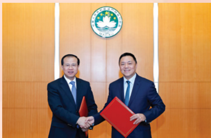
Secretary for Economy and Finance Leong Vai Tac and Vice Minister of Commerce of China Fu Ziyang exchange a summary of the first meeting of the Mainland and Macao Economic and Trade Cooperation Committee

and Road” Initiative, supporting Macao’s development as a platform between China and Portuguese-speaking countries (PSCs), and strengthening the economic and trade exchanges between the two places. These will further enhance the level of economic and trade cooperation between the two places and in turn benefit their business sectors. After the meeting, the Ministry of Commerce of China and the Macao SAR Government signed the Agreement on Trade in Goods of CEPA.