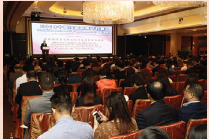
The China Investment Policy Seminar 2018 is successfully held

questions that were of concern to the business sector, deepening the understanding of China's investment policies among Macao's business sector.