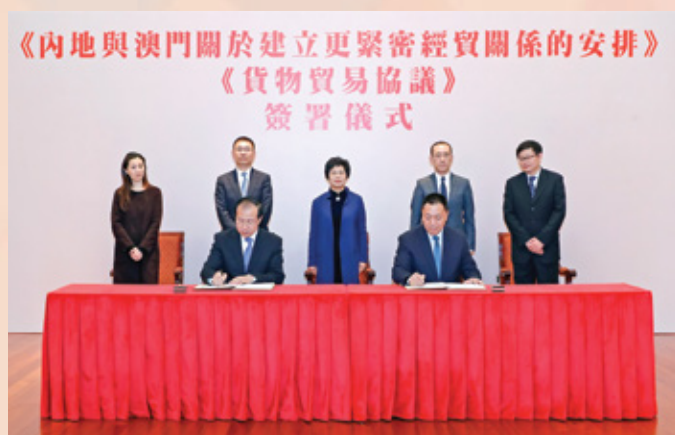
Acting Chief Executive Chan Hoi Fan witnesses Secretary for Economy and Finance Leong Vai Tac and Vice Minister of Commerce Fu Ziyang signing the CEPA Agreement on Trade in Goods

the 15 years since the signing of CEPA and referring to the latest progress and achievement related to trade in goods agreements in international and regional economic cooperation, it enhances further the level of trade facilitation and provides systematic arrangements with higher comprehensiveness for the trade and exchange of goods between the two places on the basis of the full achievement of liberalisation of trade in goods between the two places.