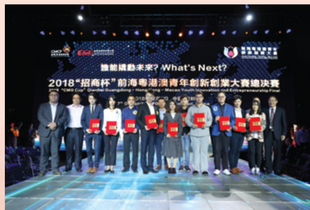
Macao youth entrepreneurship teams win the excellence awards

ceremony held in the evening, each team strived to gain additional points by delivering a one-minute-only elevator pitch and by playing its group VCR, making the process of the activity compact and attractive. Eventually, the nano-silver flexible touch control project of a Macao participating team won the bronze award of the Enterprise Group. Other projects, namely ADot, Macau Spirit, Gathering, Brother Repairs APP and Zhenxi won the excellence awards.